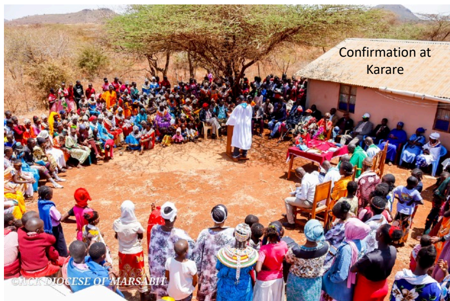
Confirmation at Karare

Marsabit has been blessed by first class Kenyan missionaries.